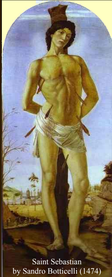
Saint Sebastian by Sandro Botticelli (1474)