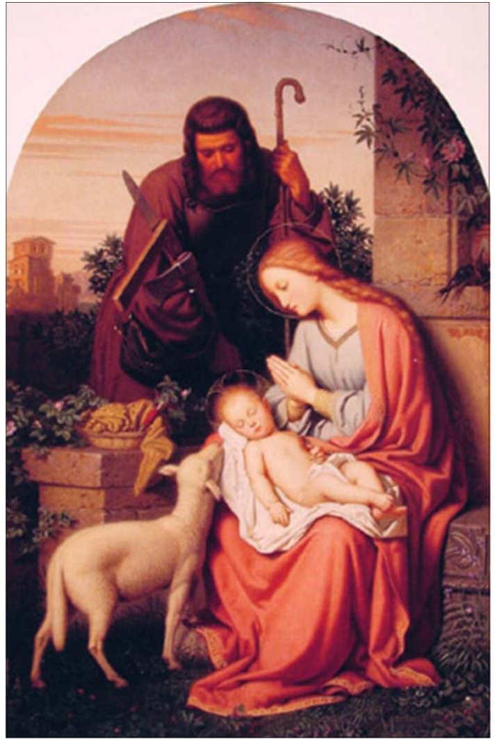
THE HOLY FAMILY OF JESUS, MARY, AND JOSEPH